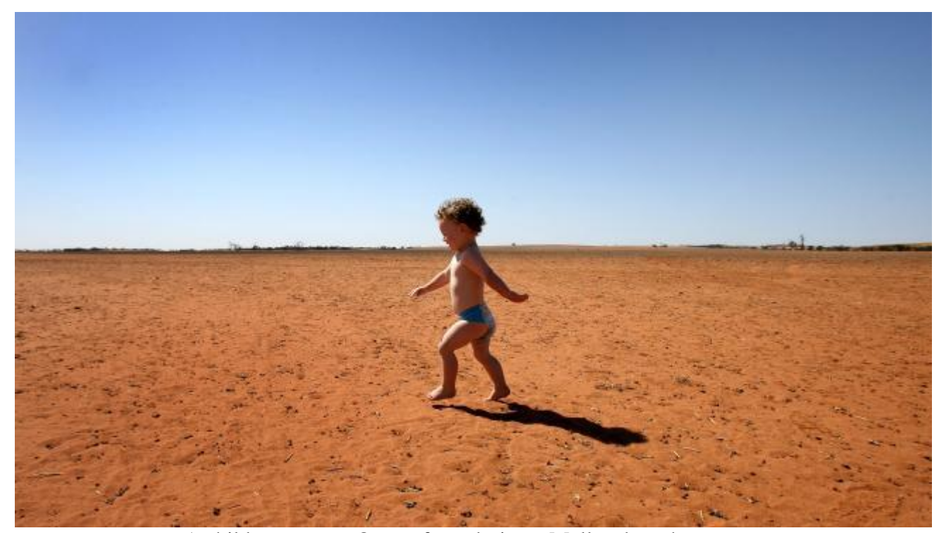
A child runs on an Ouyen farm during a Mallee drought.